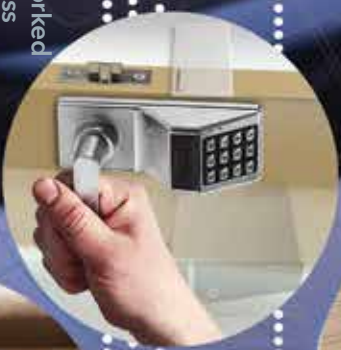
Networked Wireless Locking