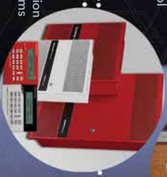
Commercial Intrusion & Fire Alarm Systems