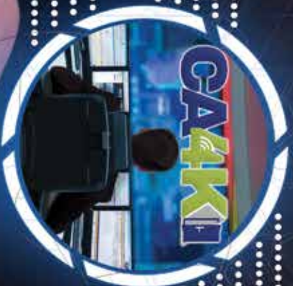
Enterprise Security Management Platform