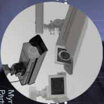
Myriad Video Partners