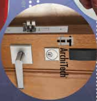
Customizable Designer Wireless Access Control