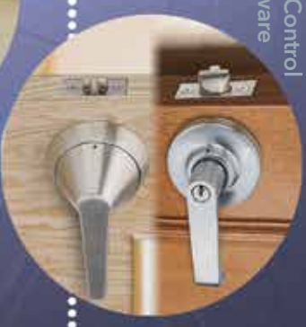
Door Control Hardware