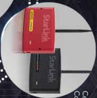
Cell/IP Alarm Communications